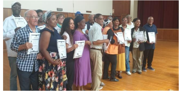
From left to right: A coaching session is budgeting, participants at Elies River library in CTand participants in Somerset West.