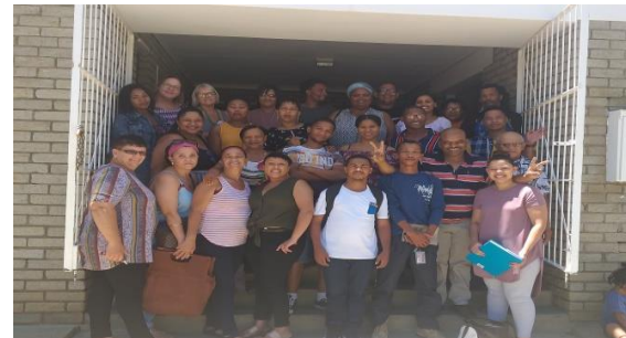
From left to right: Participants in Malmesbury, Citrusdal and Keimoes.